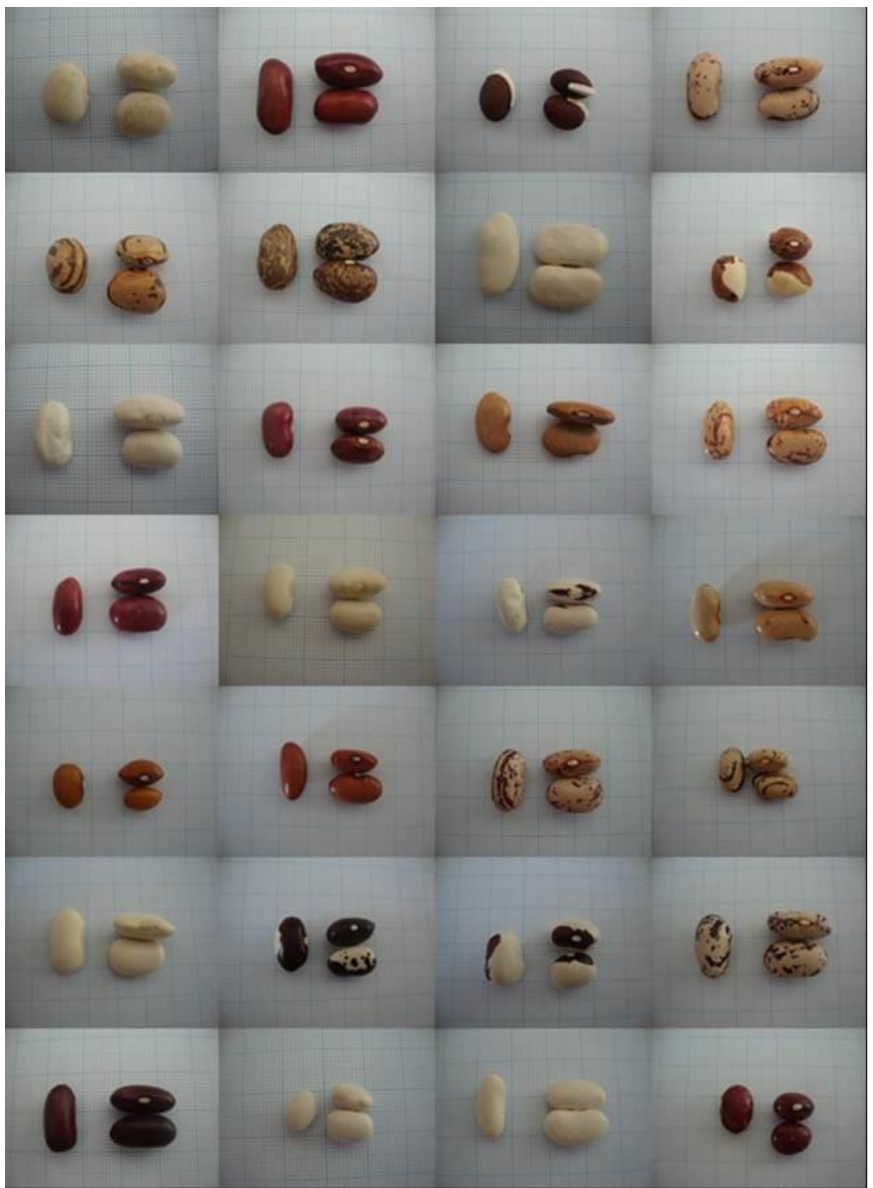
Figure 2. Diversity of seed morphology of collected from Antalya, Isparta and Burdur province