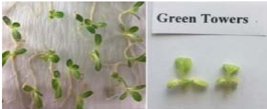
Figure 2. Inoculated fully expanded cotyledons of cv 'Green Towers' lettuce.