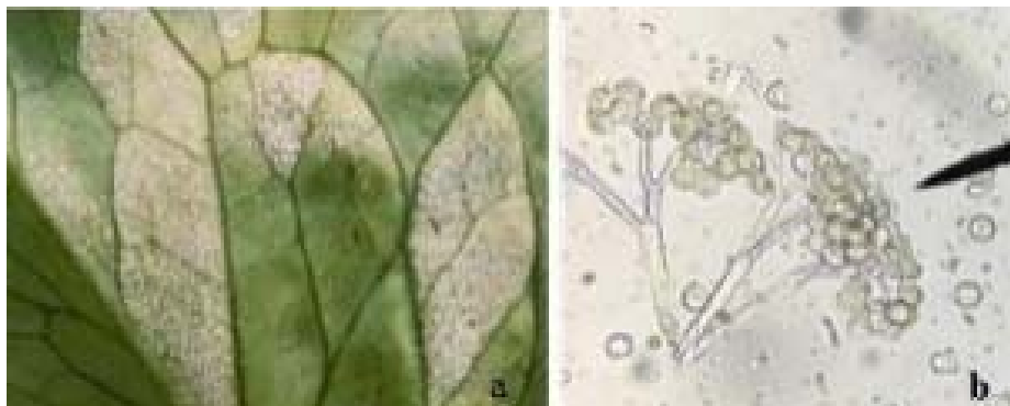
Figure 1. Infected lettuce leaf (a) with Bremia lactucae , sporangia (b).

Isolates of B. lactucae were tested on a series of 16 differential cultivars of IBEB in EU-C set as mentioned above. Each experiment was conducted at least three times. The response of the lettuce seedlings was evaluated on the 7, 11 and 14 days after inoculation. The qualitative method was used for the assessment of infected seedlings (Lebeda