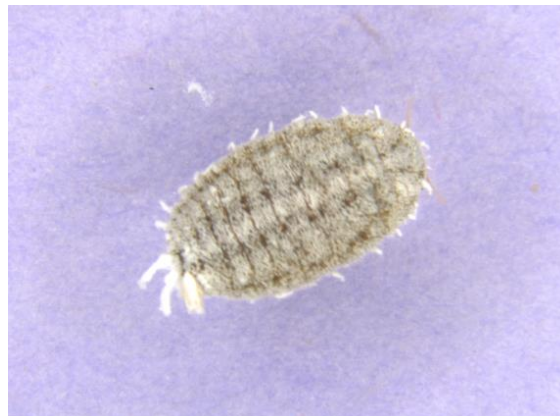
Figure 2. Adult female of Phenacoccus madeirensis .